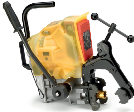
LD-16B-RP Rail drill Rainproof